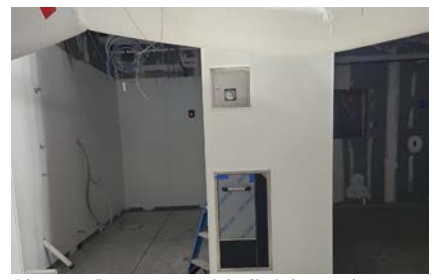
Above: Progress with finish work