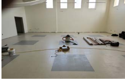
Above: Flooring installation at new addition.

\label{phase 9: The final phase includes the renovation of the balance of the existing 1st floor classroom wing, and miscellaneous exterior work on and around the building.}